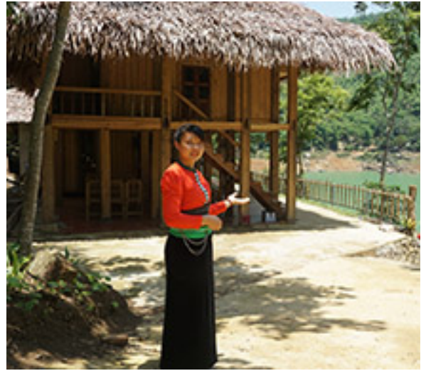
Transforming communities in the highlands of Viet Nam