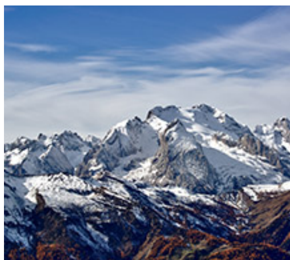
The Climate Route team crossing mountains to document climate change