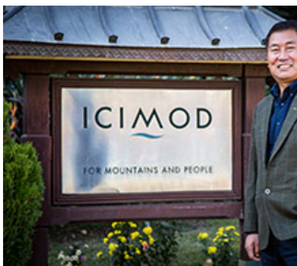
New Director General at ICIMOD