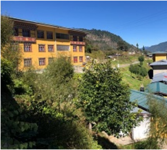
Mountain Partnership joins Zero Water Day Partnership