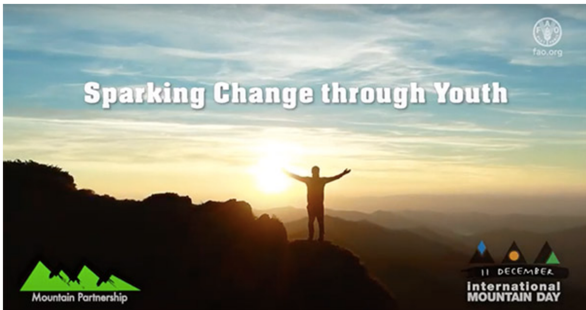
Sparking Change in Mountain Biodiversity through Youth International Mountain Day 2020 web dialogue